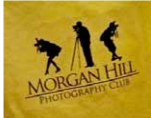
Light Shirt Transfer