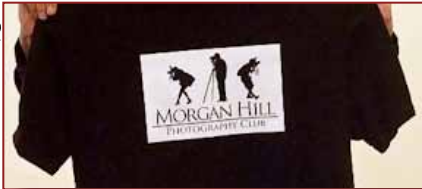
Dark Shirt Transfer